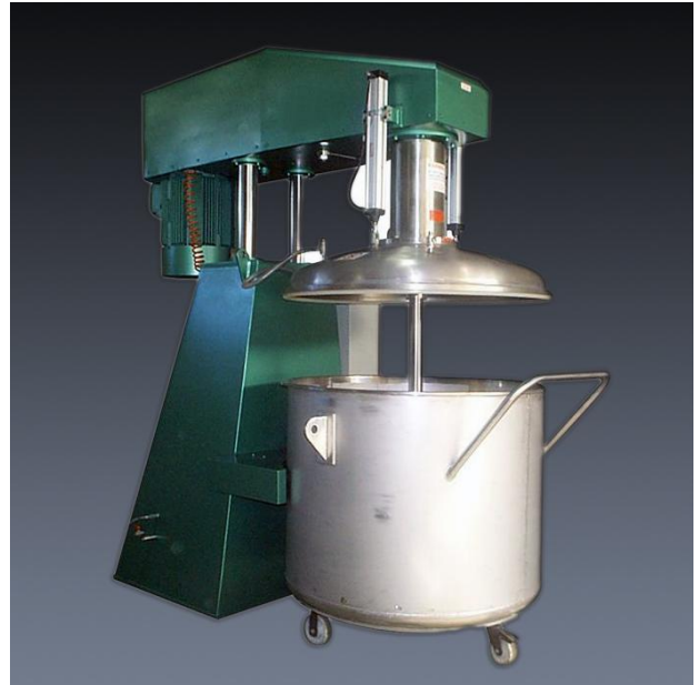
PD High Speed Dispenser (Lifted)