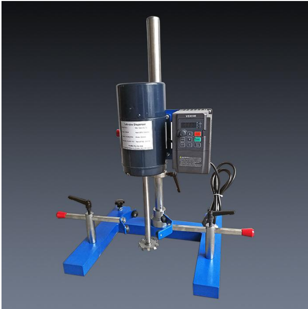
Laboratory PD Dispenser