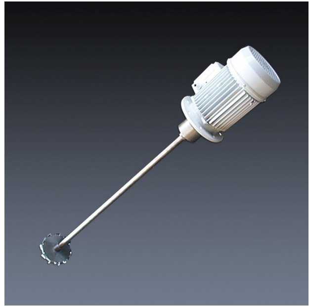
Simple PD Dispenser