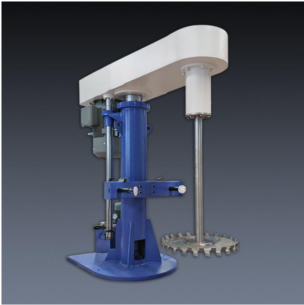
PD High Speed Dispenser