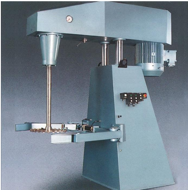
PD High Speed Dispenser